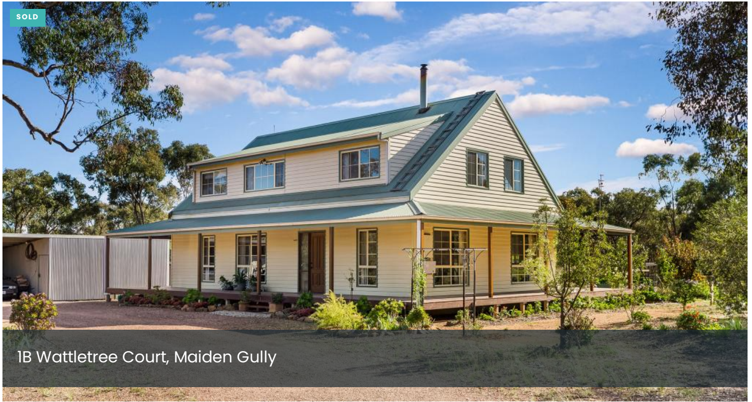
1B Wattletree Court, Maiden Gully