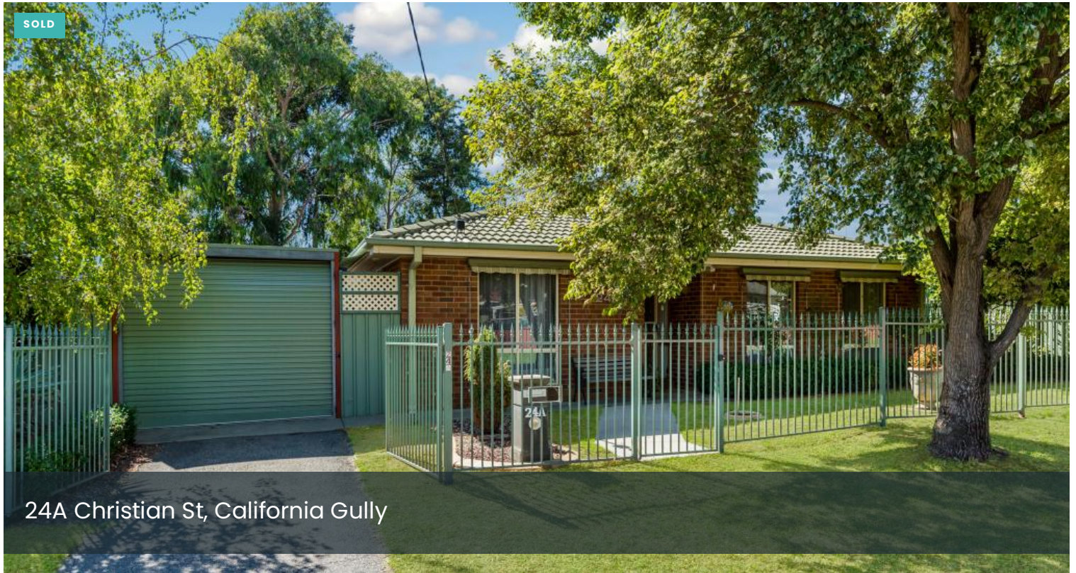
24A Christian St, California Gully