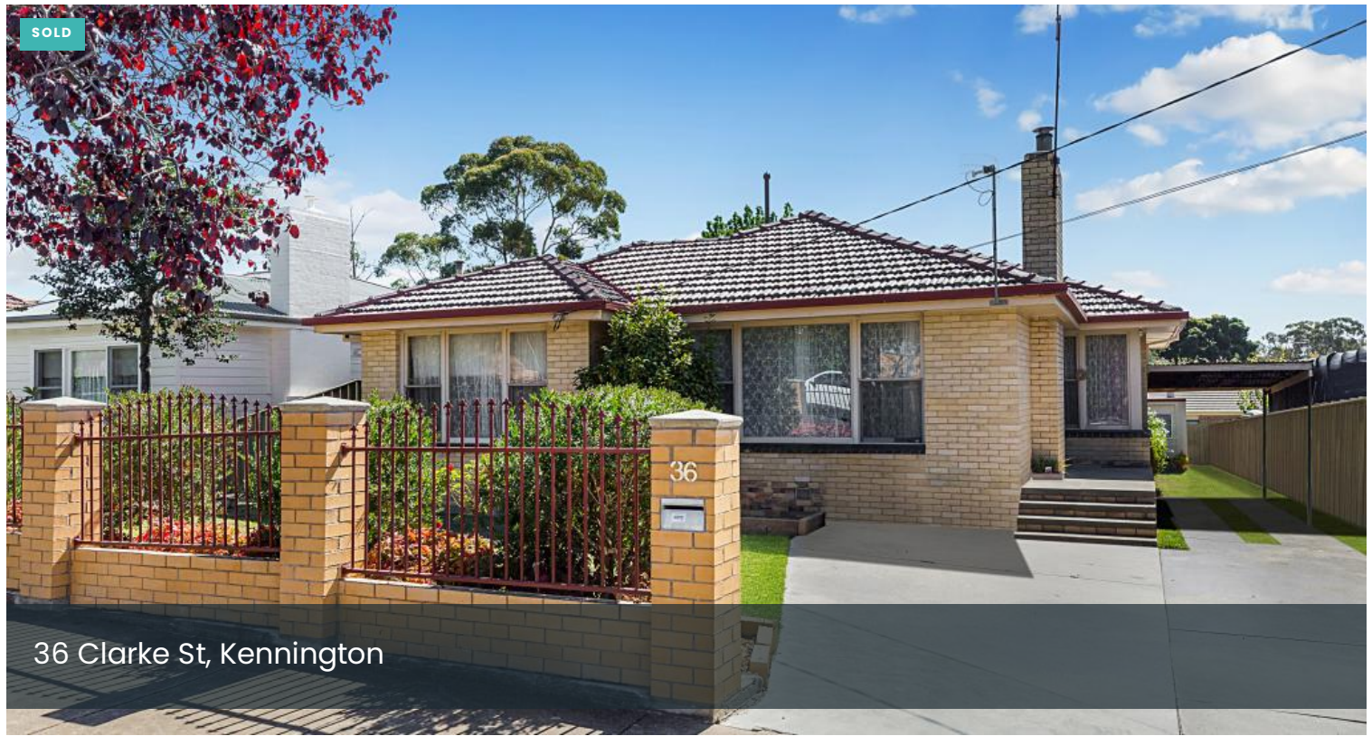
36 Clarke St, Kennington