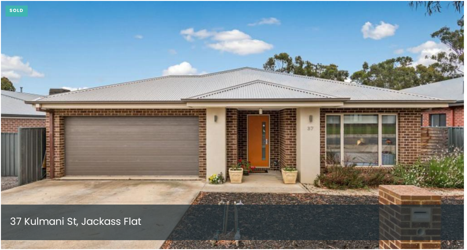
37 Kulmani St, Jackass Flat