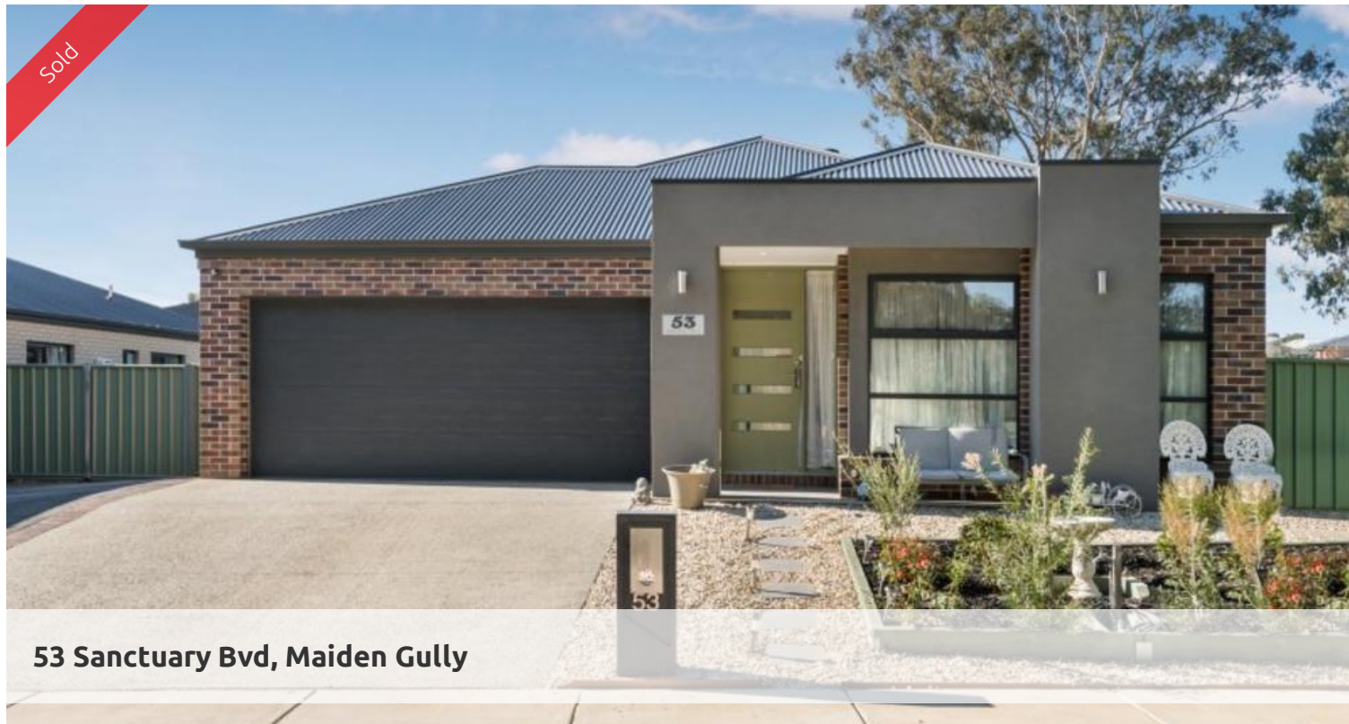
53 Sanctuary Bvd, Maiden Gully