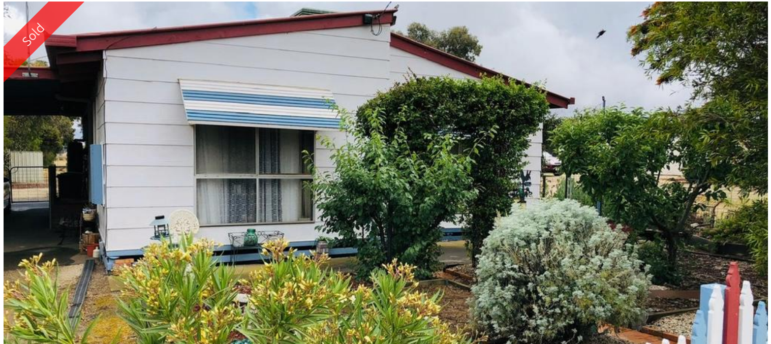
126 Main St, Sebastian