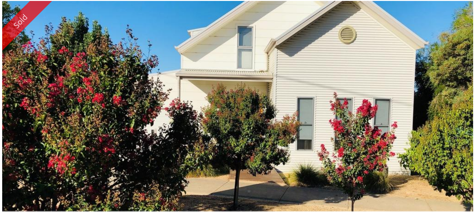
73A Napoleon Cres, White Hills