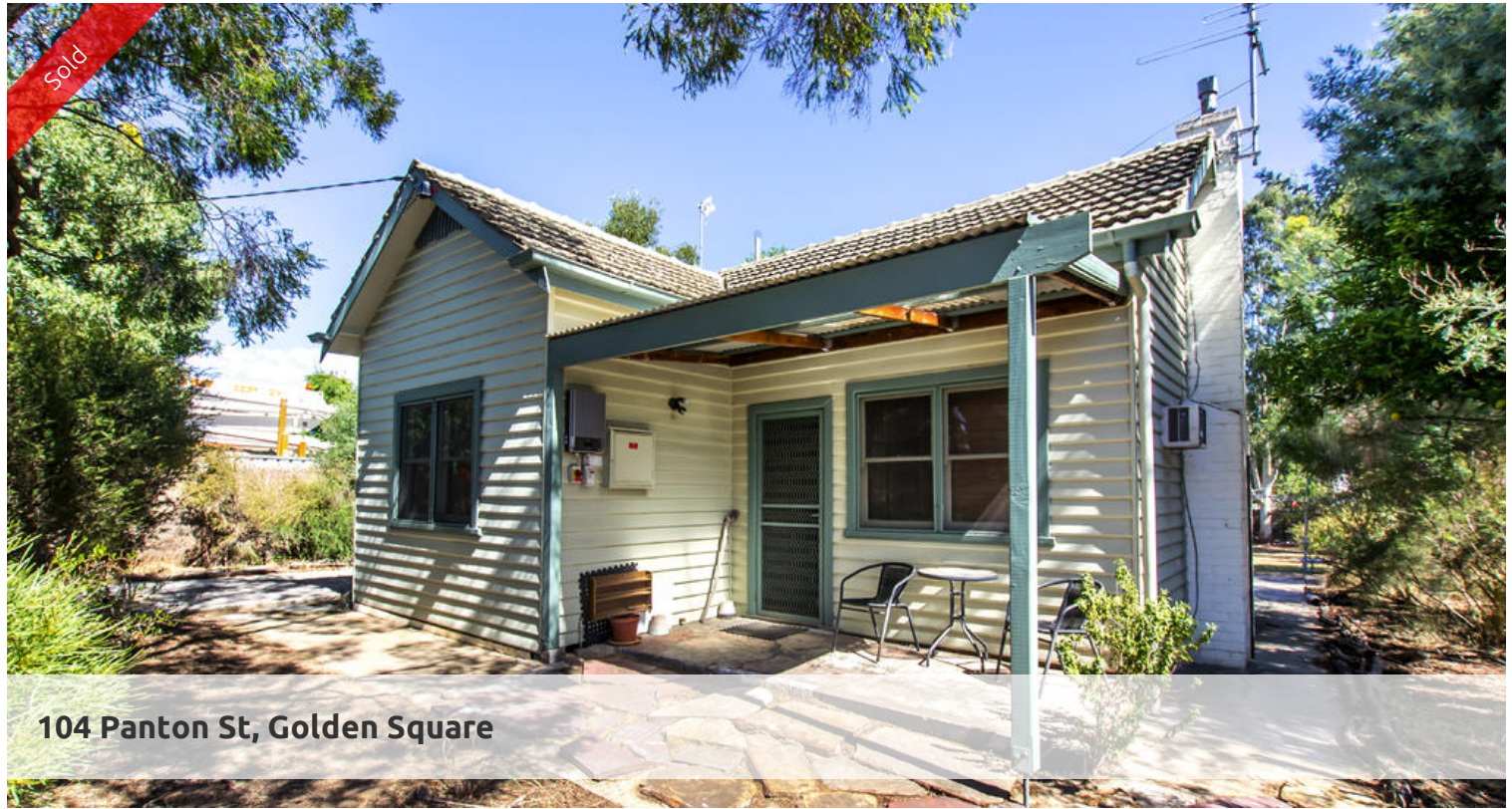
104 Panton St, Golden Square