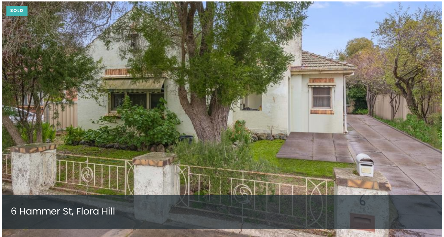
6 Hammer St, Flora Hill