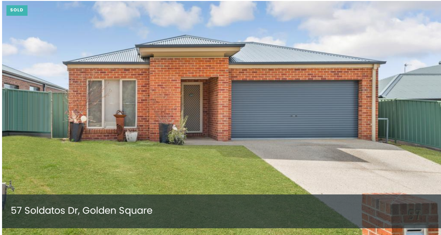
57 Soldatos Dr, Golden Square