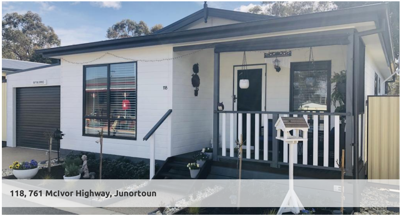
118, 761 McIvor Highway, Junortoun