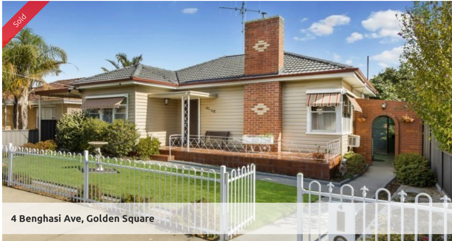
4 Benghasi Ave, Golden Square