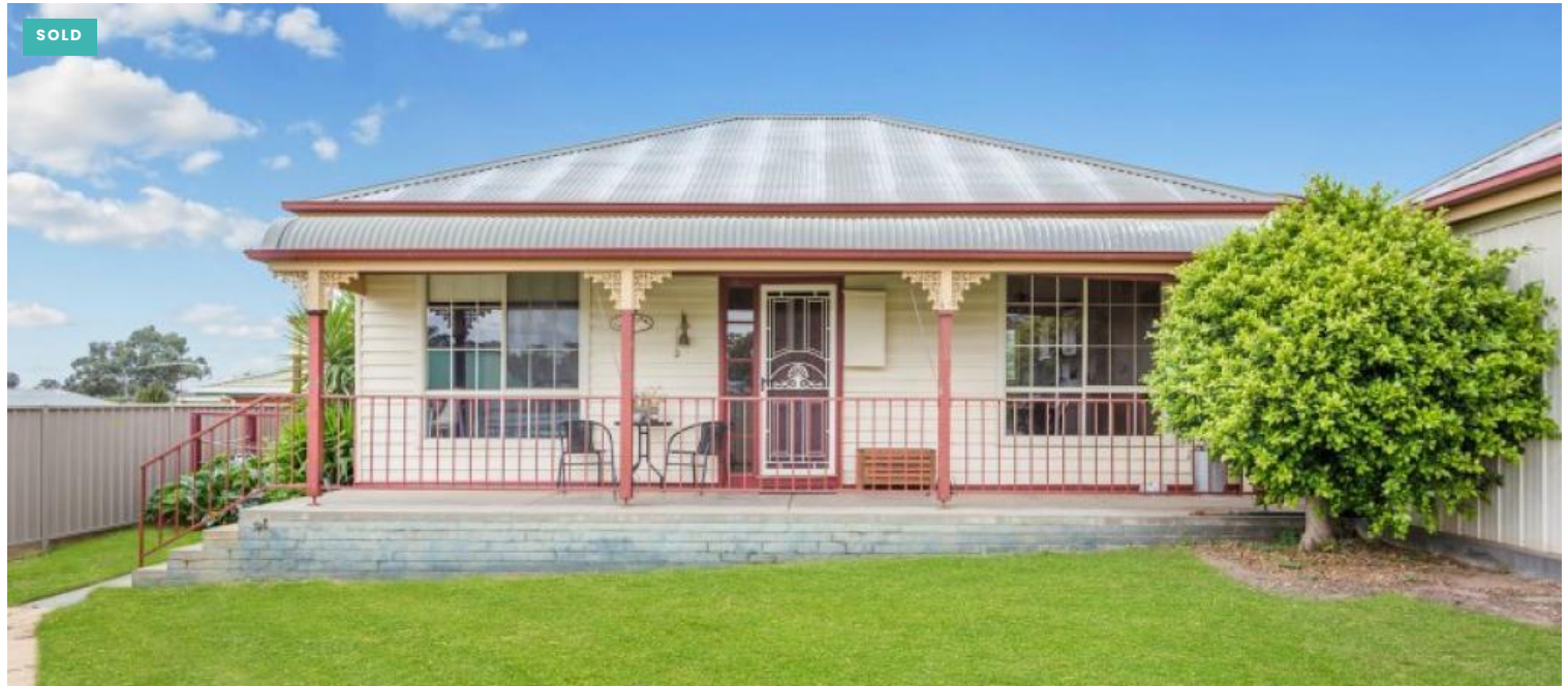
5 Kilby Ct, Kangaroo Flat