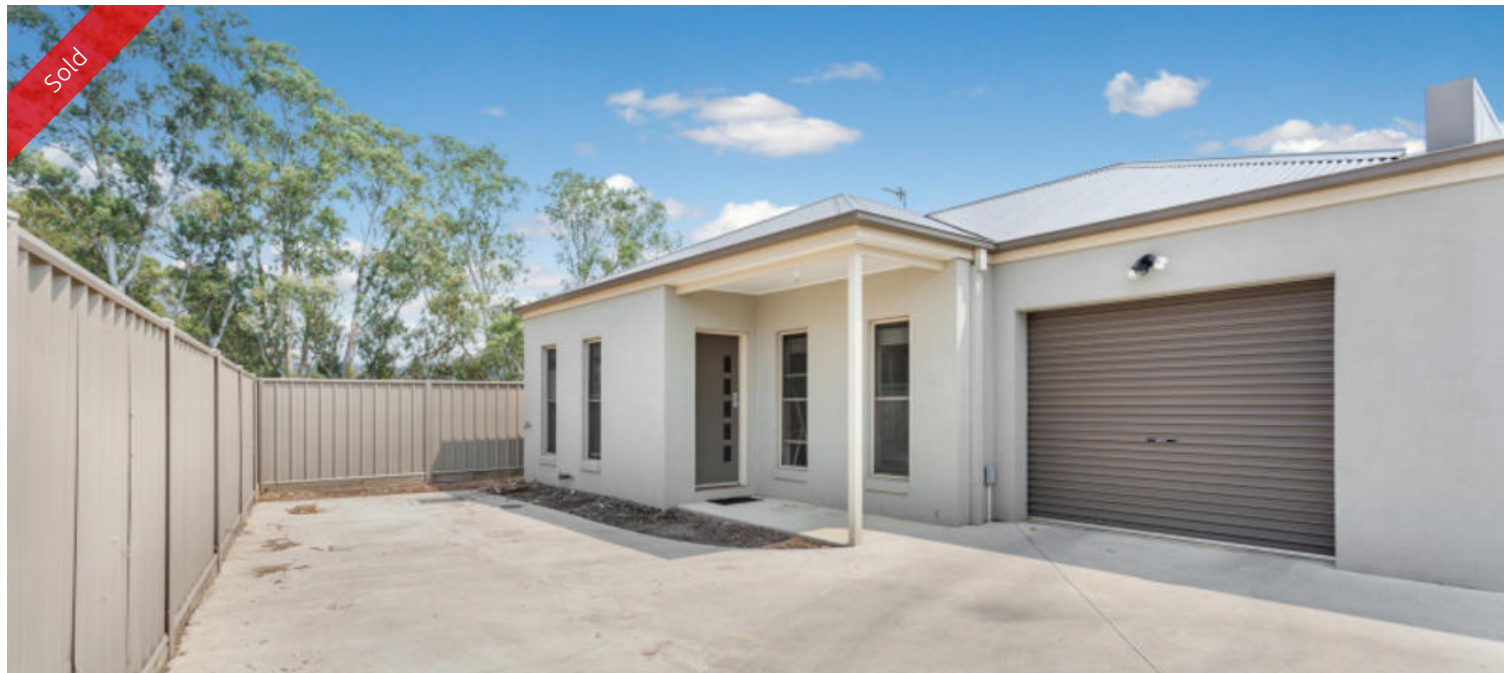
Unit 4, 494 High St, Golden Square