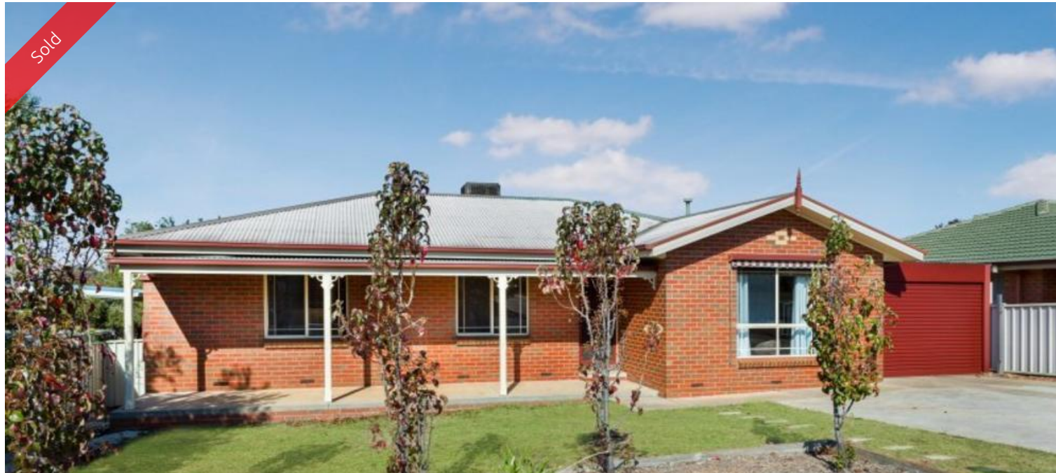
16 Banool St, Golden Square