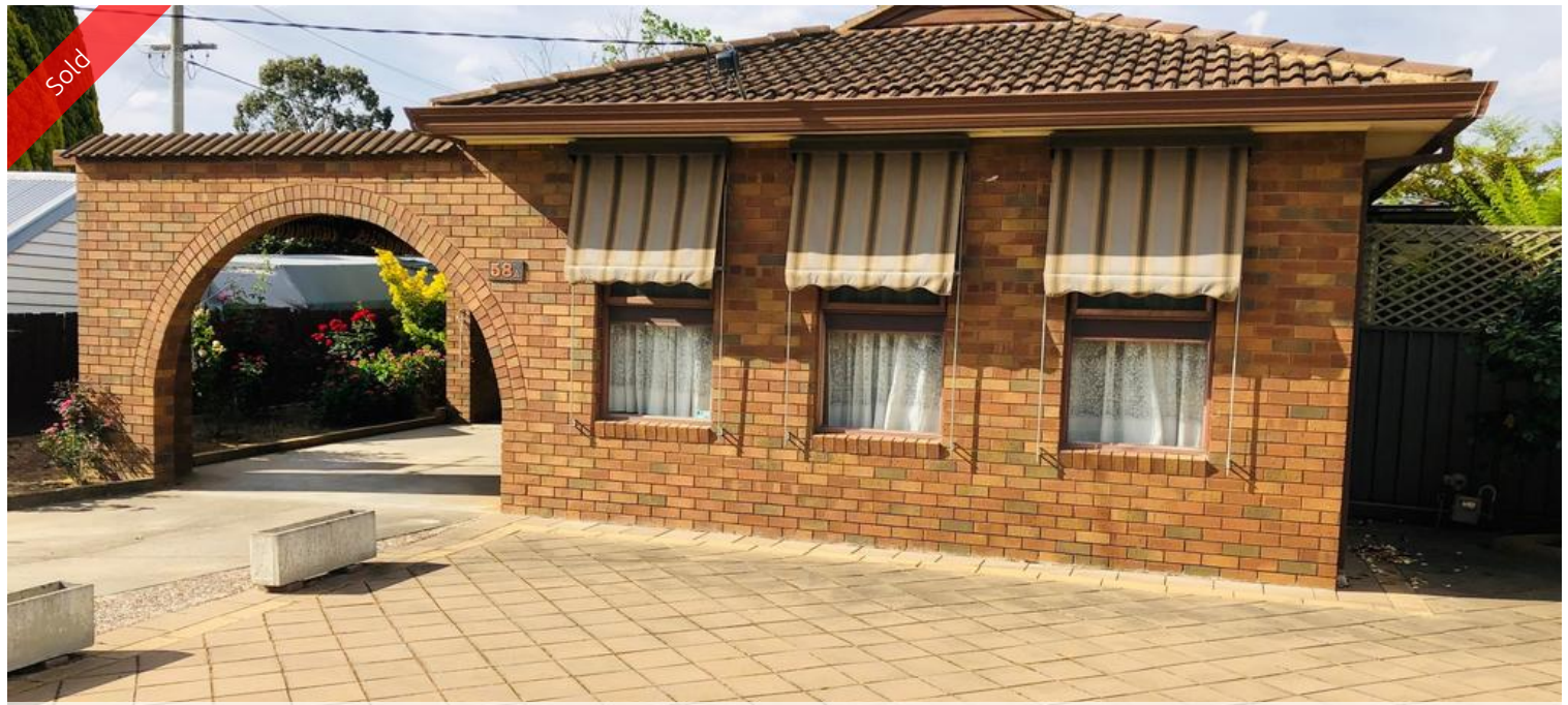
58A Peg Leg Rd, Eaglehawk