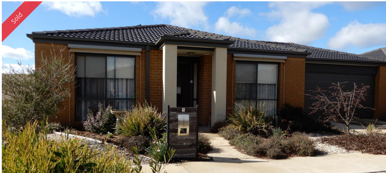
1 ONeil Court, Epsom