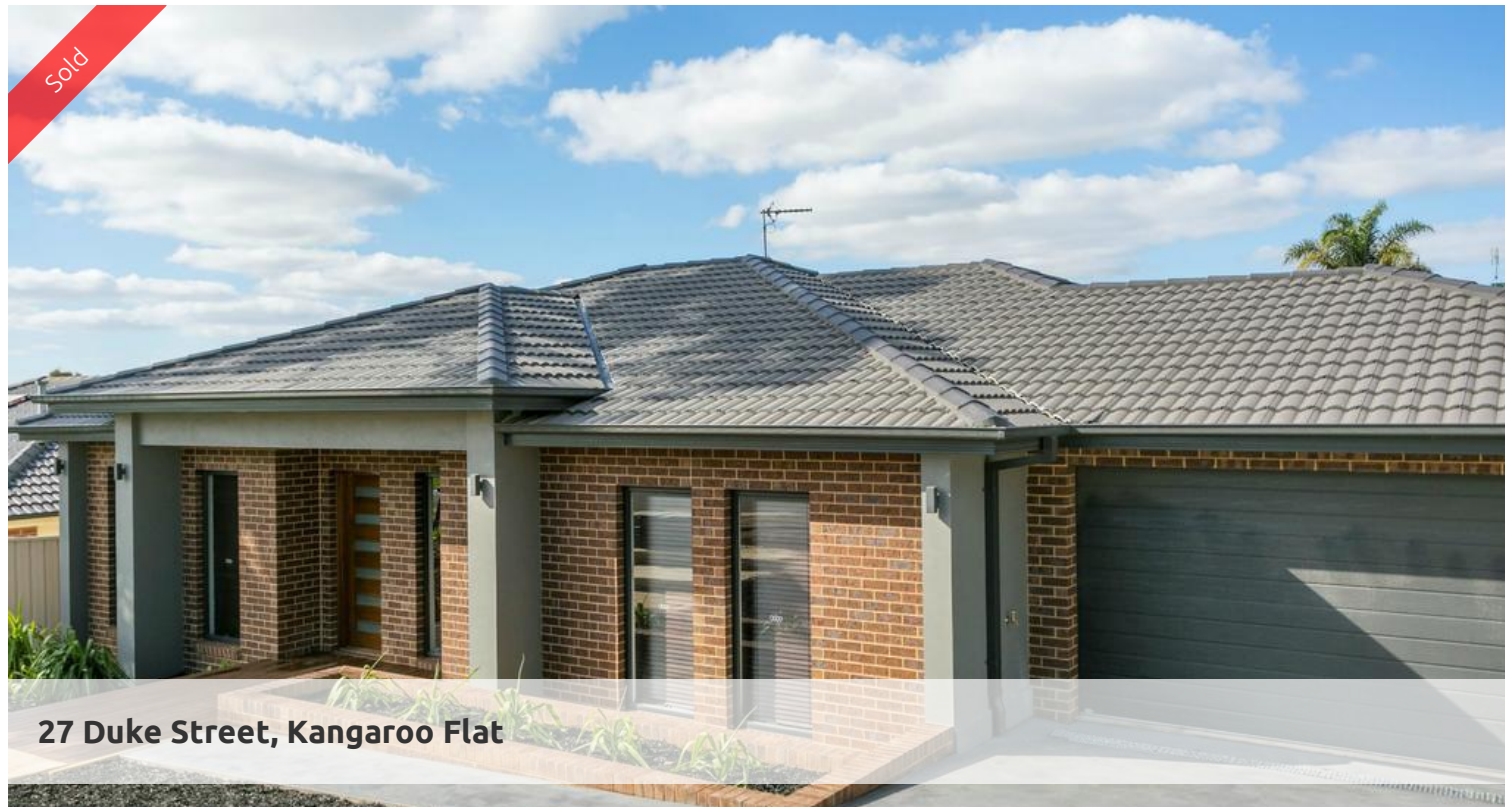
27 Duke Street, Kangaroo Flat